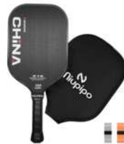
PowerCore China - Elongated Handle $210