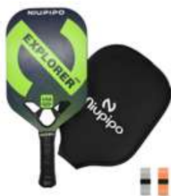
PowerCore Explorer Pro - Elongated $140