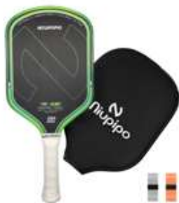
PowerCore Round Top Green - Elongated Handle $210