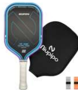
PowerCore Square Top Blue - Elongated Handle $210