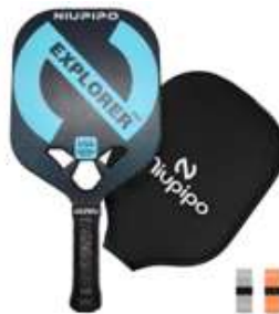
PowerCore Explorer Pro - Widebody $140