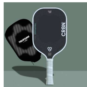
CRBN 1 TruFoam Genesis (Elongated, Long Handle) $436.00