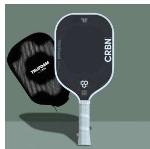
CRBN 1 TruFoam Genesis (Elongated, Long Handle) $436.00