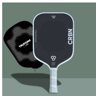
CRBN 2 TruFoam Genesis (Square) $436.00