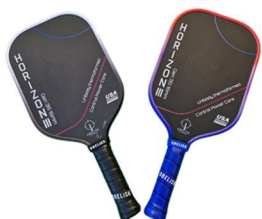
Horizon III Gen3S $249

Use BRIAN10 for a 10% discount on your order