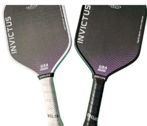
Invictus III Gen3 $249