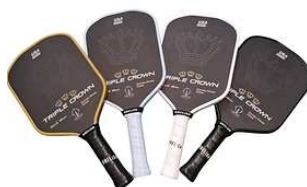
Triple Crown Gen3 $249