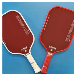
Red Horizon $189