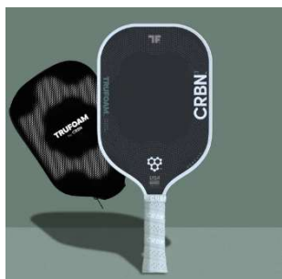
CRBN 3 TruFoam Genesis (Elongated) $436.00