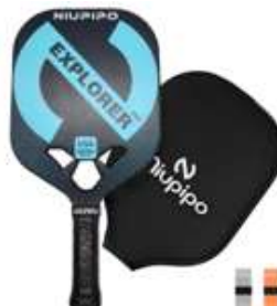
PowerCore Explorer Pro - Widebody $140