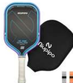
PowerCore Square Top Blue - Elongated Handle $210