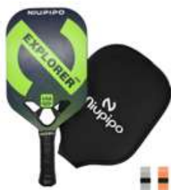
PowerCore Explorer Pro - Elongated $140