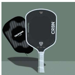
CRBN 4 TruFoam Genesis (Hybrid, Aerocurve) $436.00

Use BRIANCRBN for a 10% discount on your