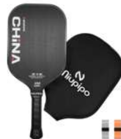
PowerCore China - Elongated Handle $210