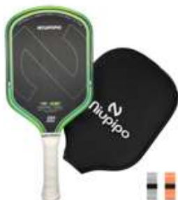
PowerCore Round Top Green - Elongated Handle $210